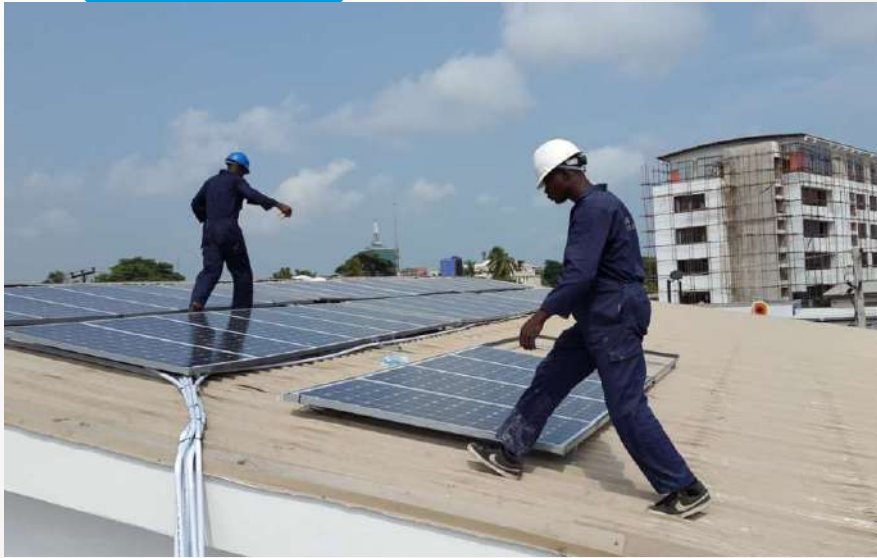
Solar PV Installation for a Commercial Bank, Ikoyi