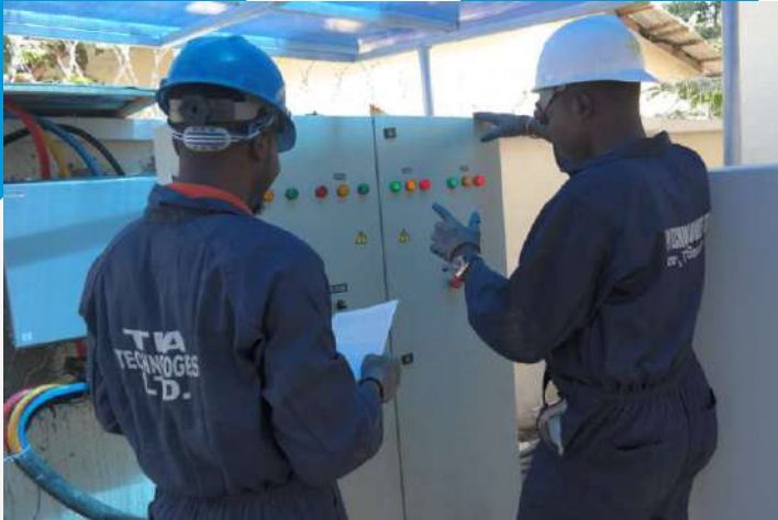
Maintenance of Electrical Installation