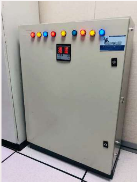
Mains LV Panel with Surge protection