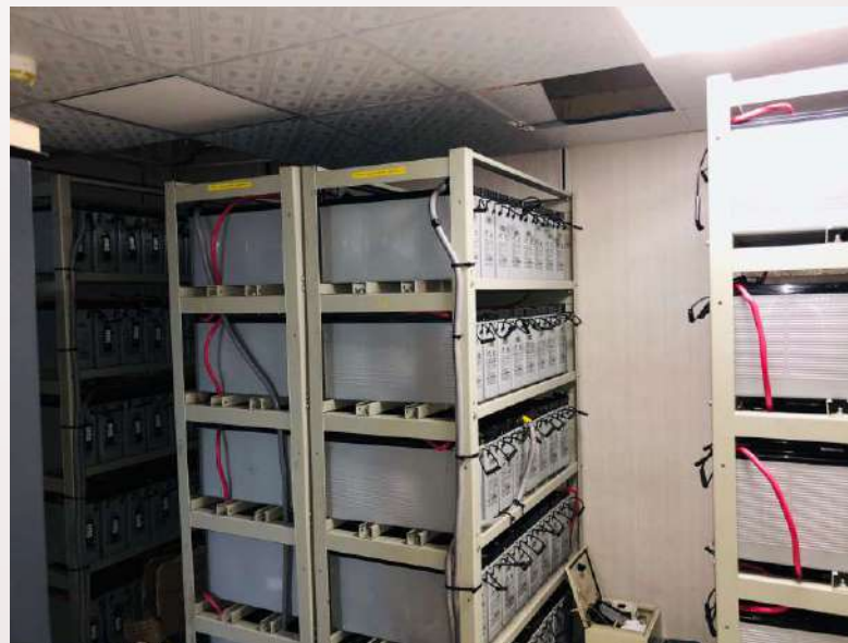
Backup Bank for Main Data Centre