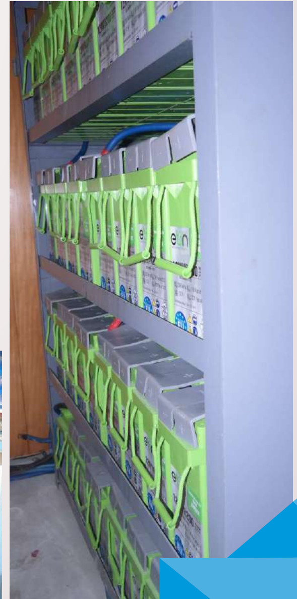
Battery bank for Inverter system