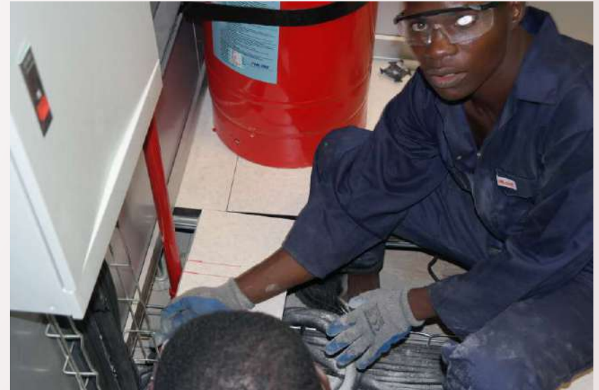
Data and Power distribution