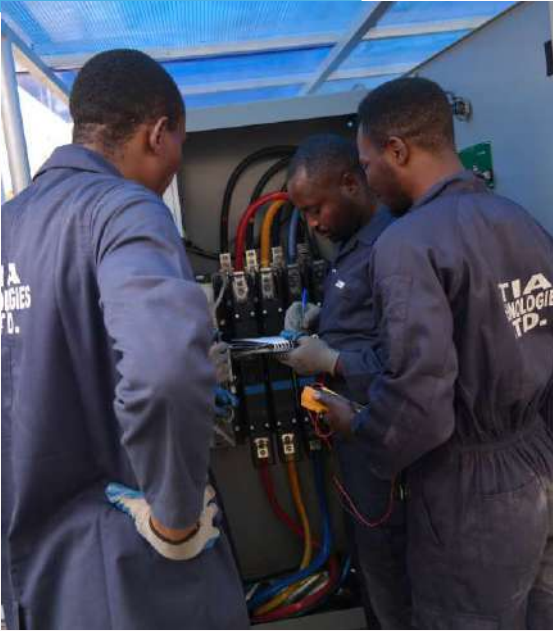
ASCO 300 Series ATS Installation