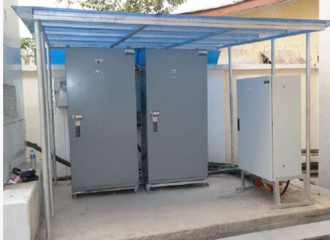
ASCO ATS for a Tier III Data Centre Environment