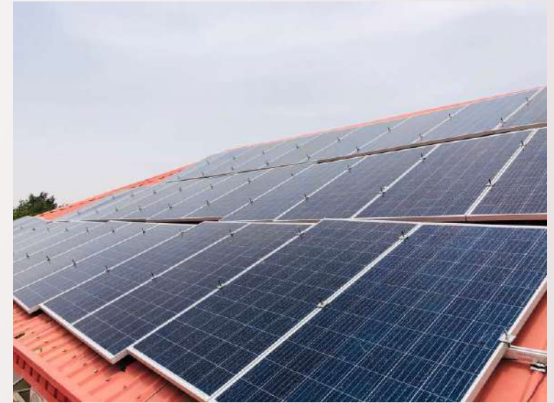
Solar Hybrid system for Queen Amina College Kaduna