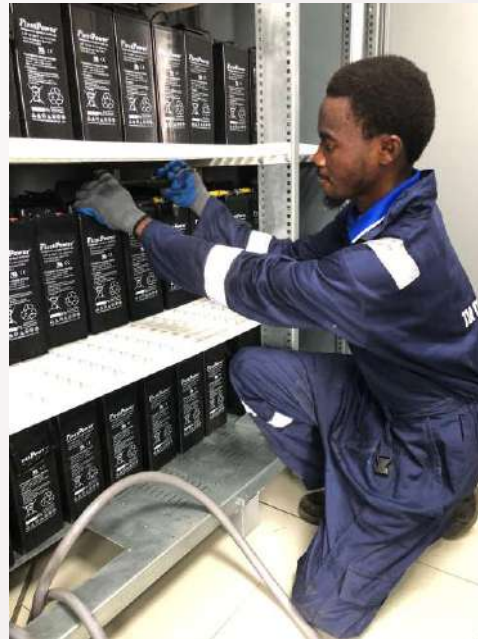
Battery Bank for Data Centre UPS