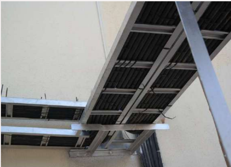
Tier III Power Feed for Data Centre