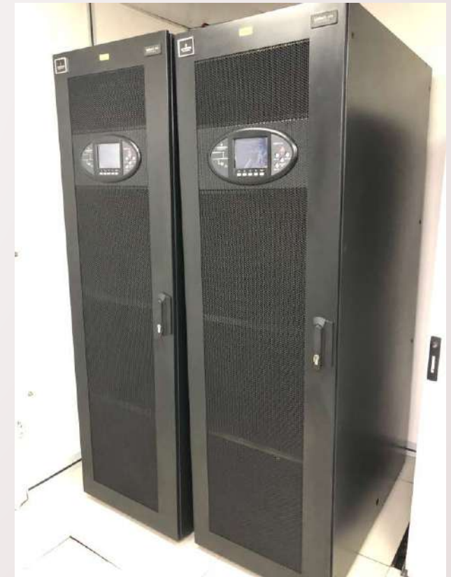
Vertiv/Emerson Modular UPS Installed