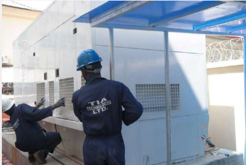
Backup Generator for Data Centre