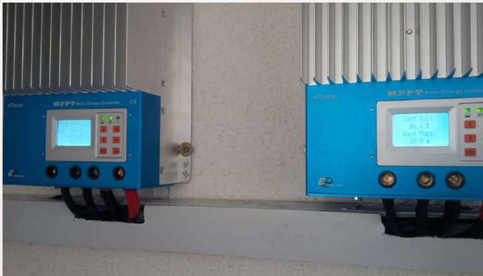
MPPT Charge controller system