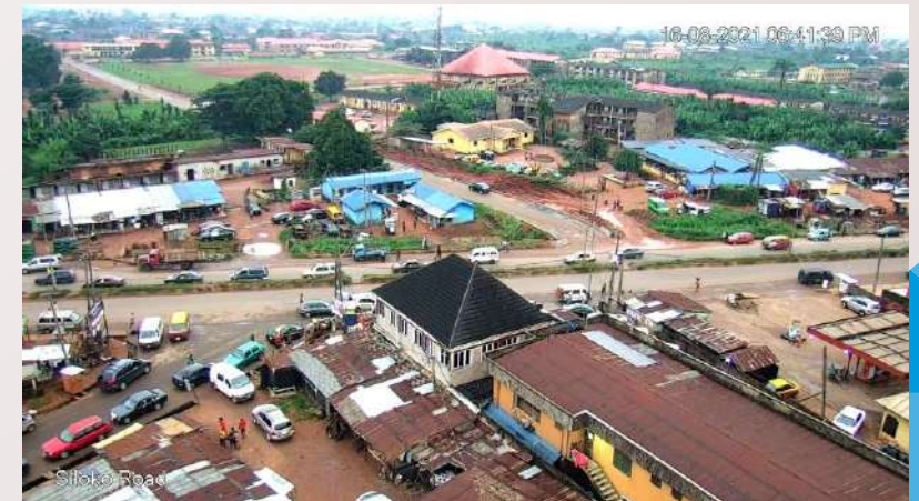
PTZ View of community monitoring, Nigeria