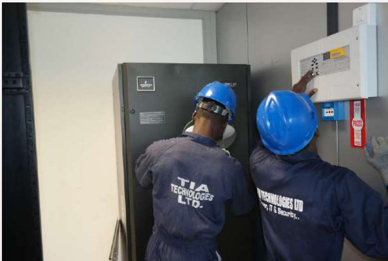
Precision Air Conditioning (HPAC) and Fm200 Fire defence system