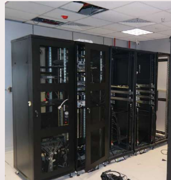
Fire/Smoke detection, Cable management