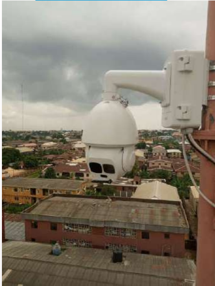
Speed dome for Highway Surveillance