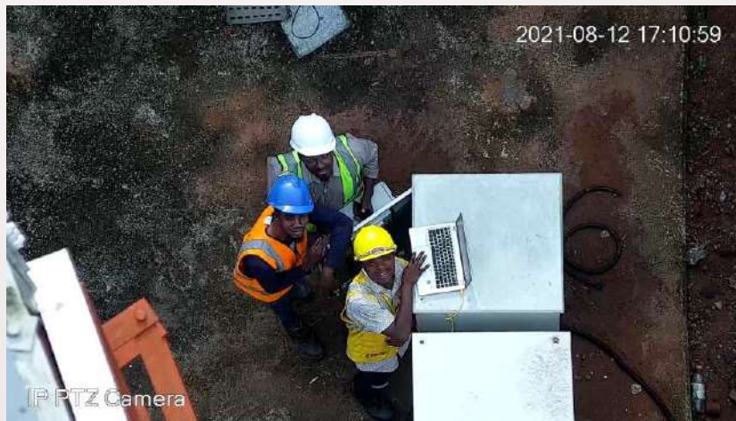
Speed dome view from the Mast apex