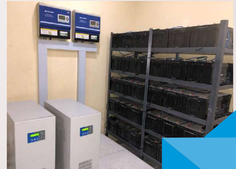
Hybrid system configured for 3 days