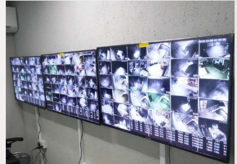
Central Control Room for Surveillance Monitoring, Ikoyi