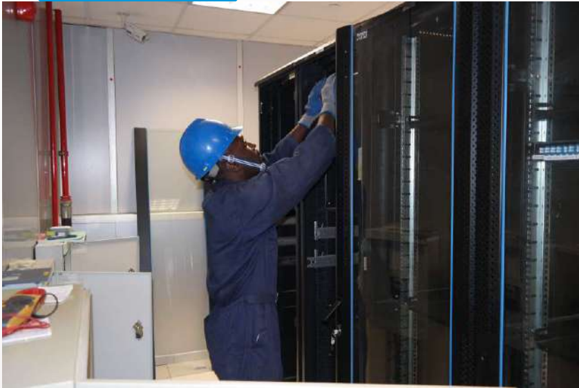
42U Rack assembling and positioning