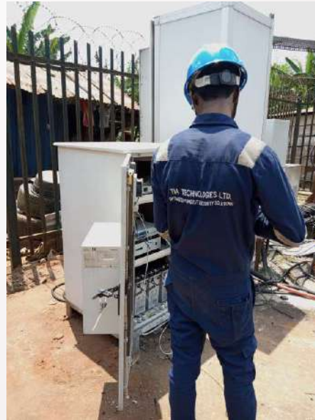
Fibre connectivity for real time remote viewing of highway surveillance